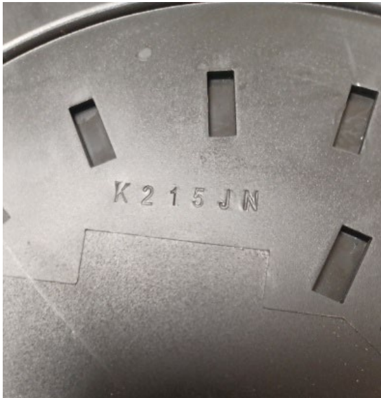
15 Photo 3

1 14. Both the plastic bottom of the subject Pressure Cooker, and one of the 2 metal prongs of the power cord plug of the Pressure Cooker, are embossed with the 3 code “K215JN”, which means this product was manufactured on or about the date 4 of August 3, 2017. Photos 3 and 4 below are true and correct depictions of that 5 embossed code on the subject Crock-Pot® Pressure Cooker: 6