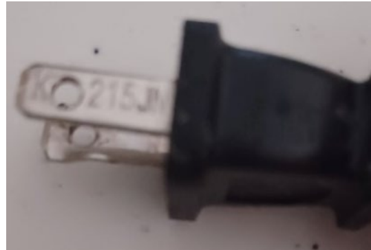
16 Photo 4

17 15. On or about November 24, 2022, while Plaintiffs Elizabeth and Philip 18 Bova were using the subject Crock-Pot® Pressure Cooker in a reasonable and 19 foreseeable way, its lid opened while the contents were under pressure. The scalding 20 hot contents forcefully erupted, which caused Plaintiff Elizabeth Bova serious burn 21 injuries. Photos 5 and 6 below show burns the erupting contents inflicted on her.