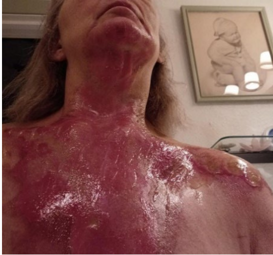
8 Photo 5