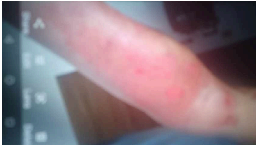
18 Photo 7

9 The Pressure Cooker also spewed its hot contents onto Plaintiff Philip Bova . Photo 10 7 below shows burns the erupting contents inflicted on him.